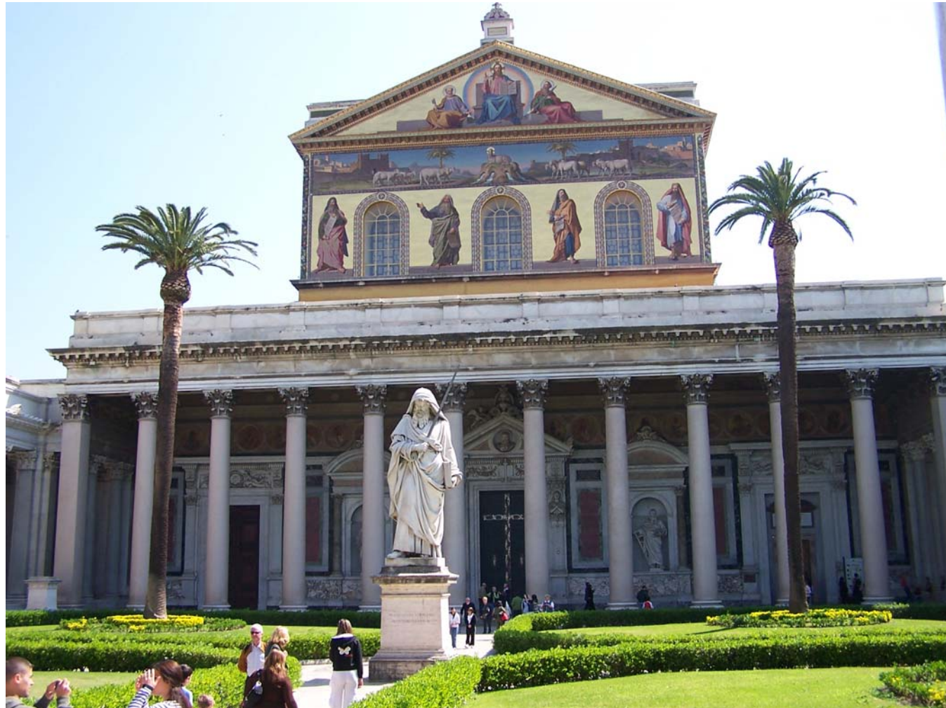
St. Paul's Outside the Walls Basilica