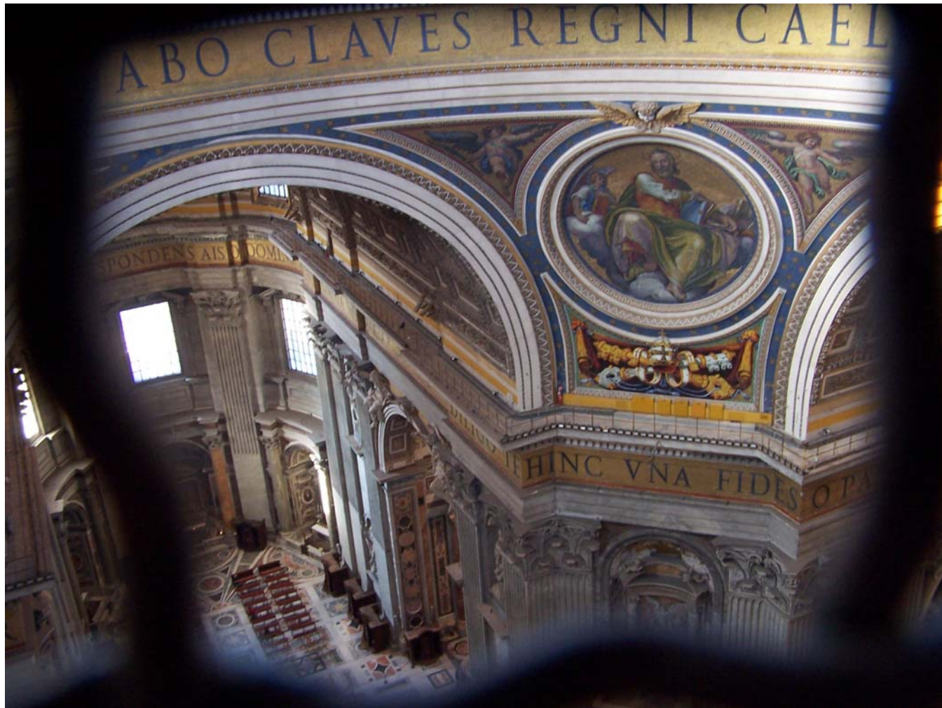
St. Peter's – photo from the inside of the dome.