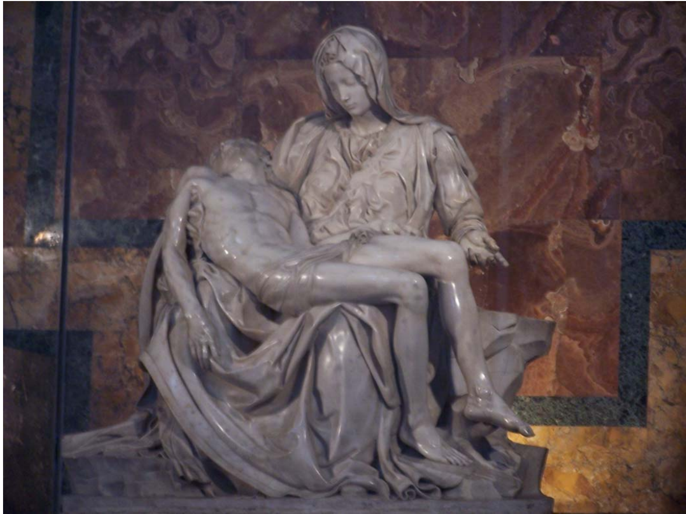
Famous statue in St. Peter's of Mary holding Jesus Michelangelo is the artist.