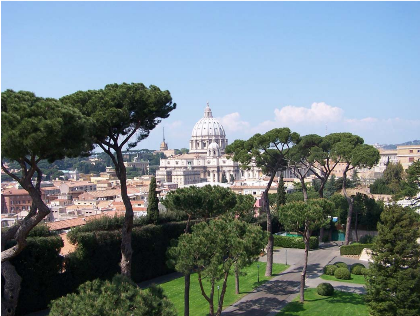
View of St. Peter's from North American College in Rome, where we stayed.