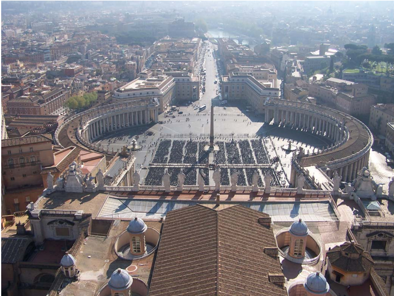
View of St. Peter's Square from the top of the dome. 323 steps – not recommended for the elderly, out of shape or claustrophobic.