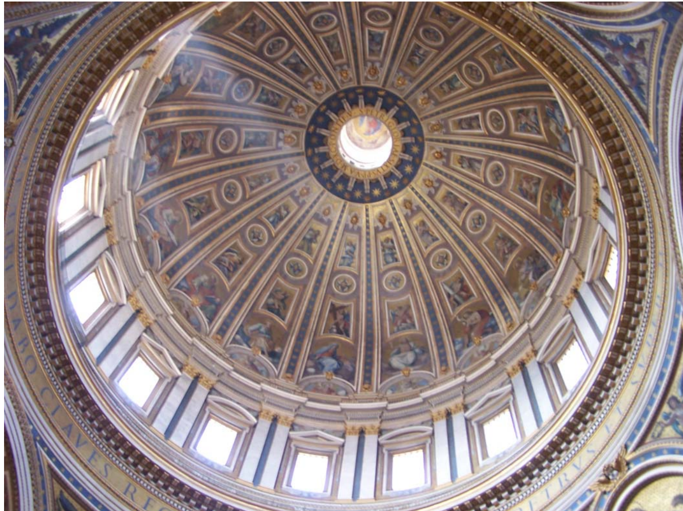
St. Peter's dome