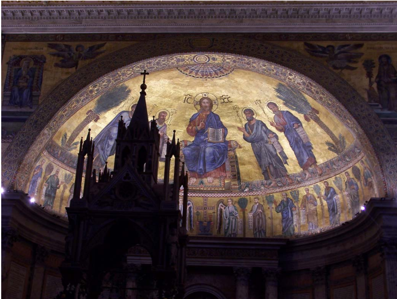
Fifth century mosaics in St. Paul's