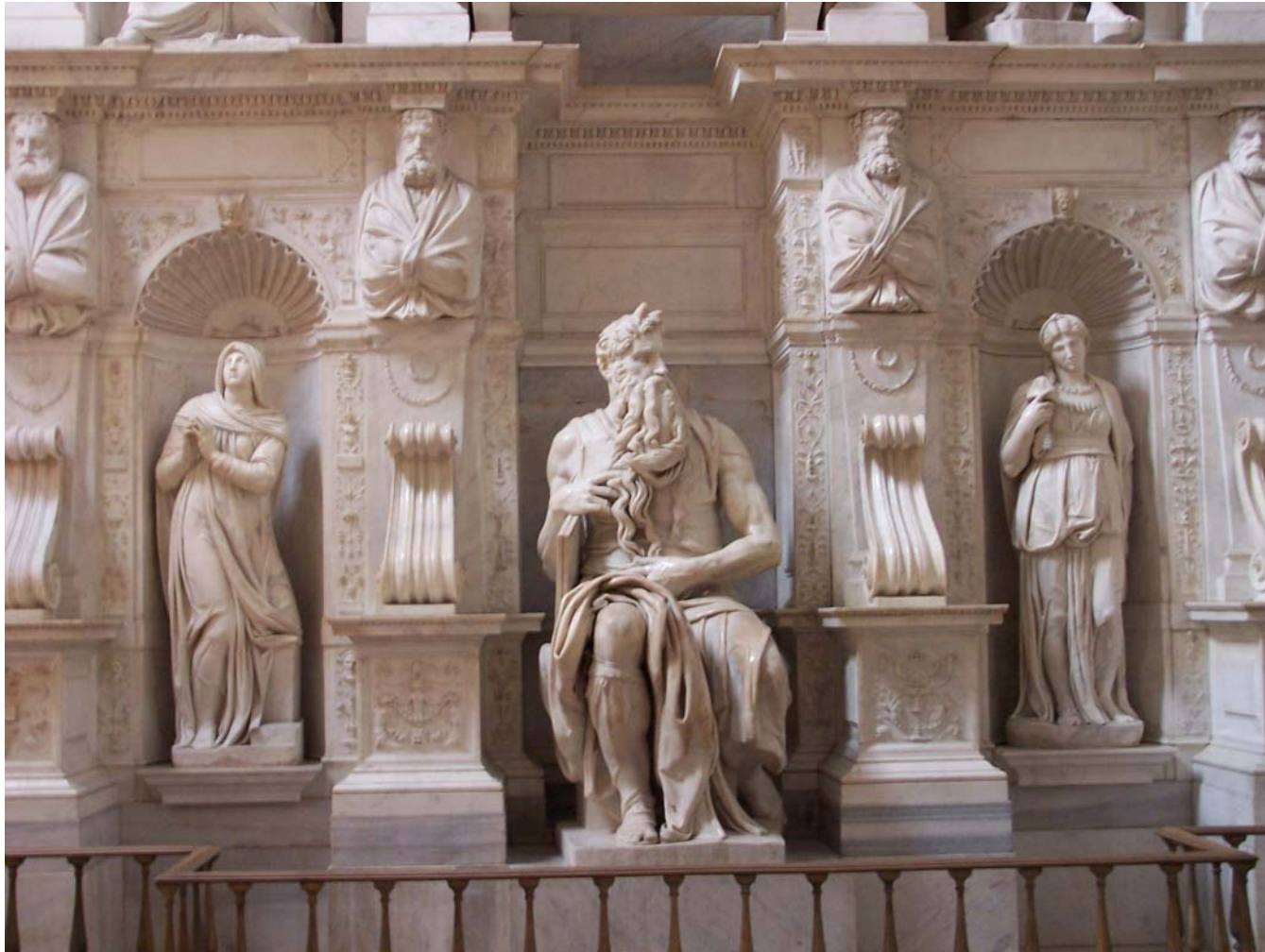
Michelangelo statue of Moses in St. Peter in Chains Church