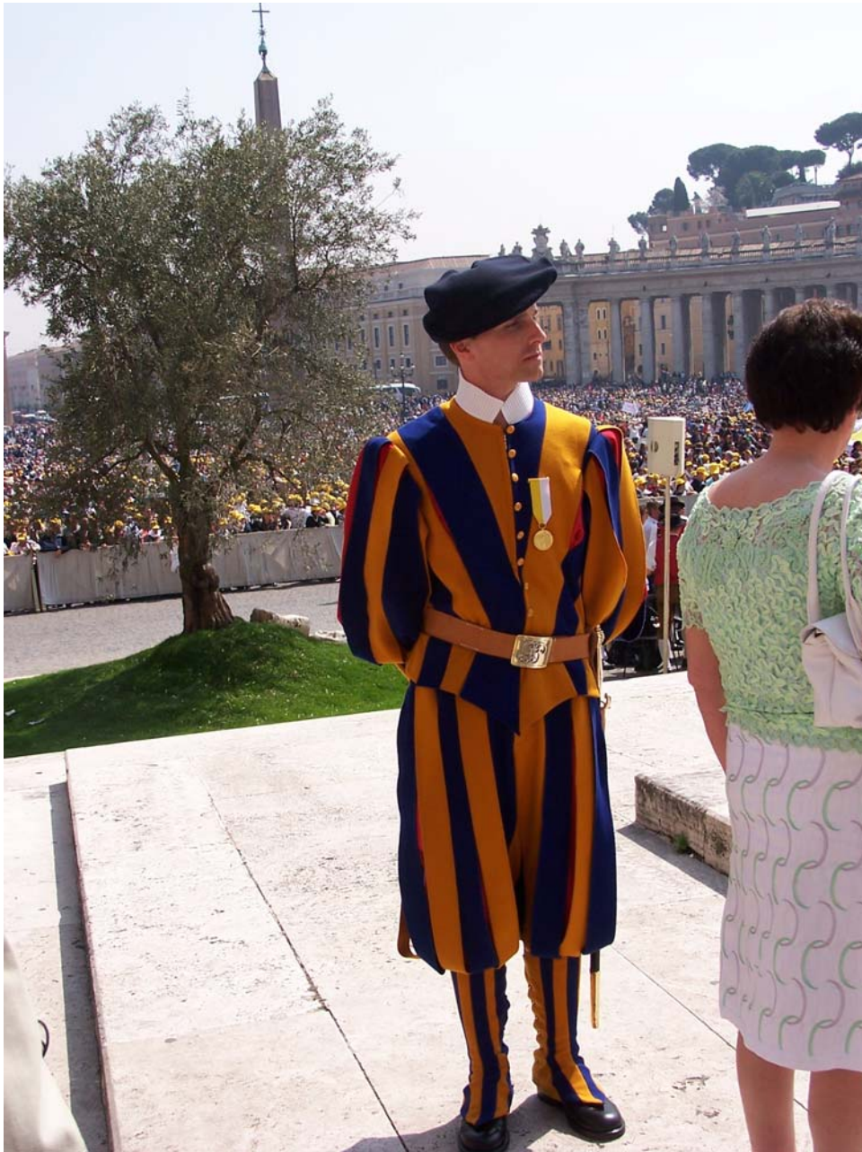
One of the Pope Guards