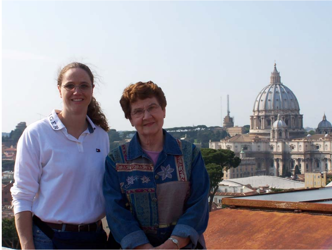
Mom and I with St. Peter's in the background