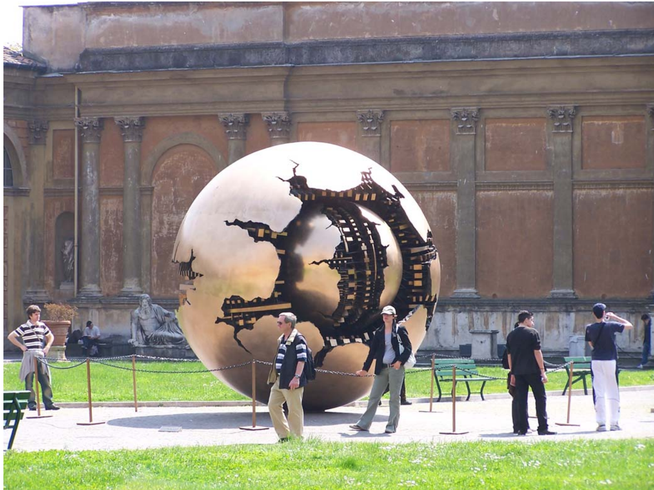
Some sort of art in the courtyard of the Vatican Museum