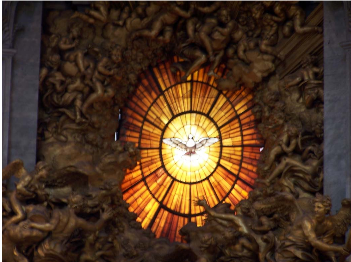
Sliced alabaster behind altar.