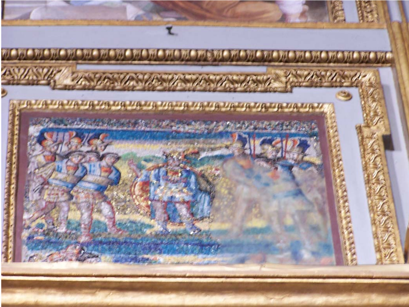
Mosaic in Basilica of St. Mary Major. It dates from 450AD – right side is partially ruined