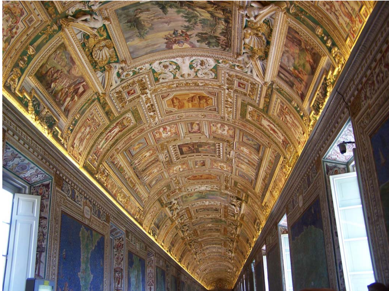
Ceiling at Vatican Museum beautiful as far as you can see